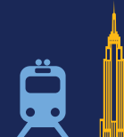
EXHIBIT HALL HOURS